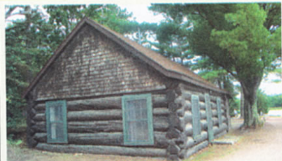
Bent's Camp Cabin