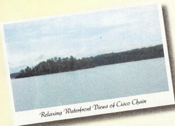
Relaxing Waterfront Views of Cisco Chain

As they have for more than a century, the 10 cabins rest along the shore of Mamie Lake, promising happy vacation memories within their walls. Inside the lodge, patrons chat and enjoy sweeping views of the lake.