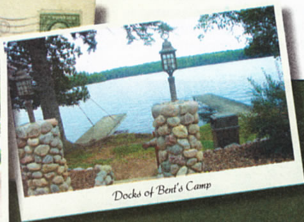
Docks of Bent's Camp